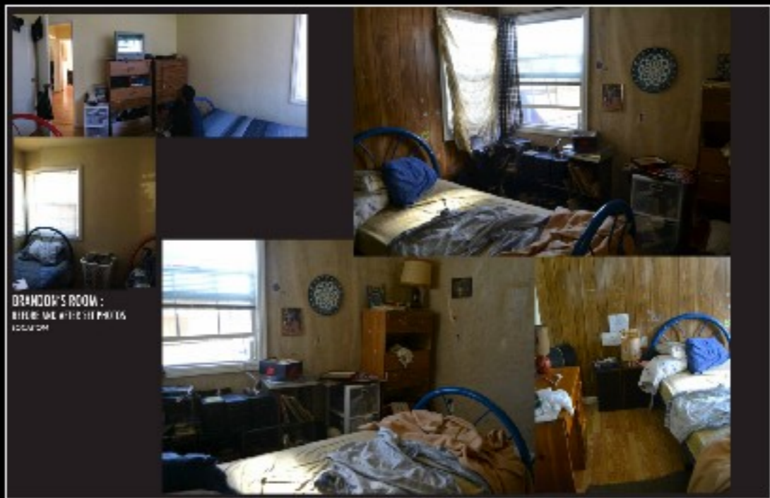
BRANDON'S ROOM: BEFORE AND AFTER SET PHOTOS JOSH KRAVITZ