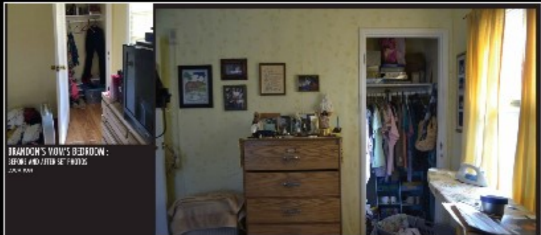
BRANDON'S MOM'S BEDROOM: BEFORE AND AFTER

FIFTEEN-YEAR-OLD BRANDON LONGS FOR A PAIR OF THE FRESHEST SNEAKERS THAT MONEY CAN BUY. ASSUMING THAT MERELY HAVING THEM ON HIS FEET WILL HELP HIM ESCAPE THE REALITY OF BEING POOR, NEGLECTED BY THE OPPOSITE SEX AND PICKED ON BY EVERYONE - EVEN HIS BEST FRIENDS. WORKING HARD TO GET THEM, HE SOON FINDS THAT THE TITULAR SHOES HAVE INSTEAD MADE HIM A TARGET AFTER THEY ARE PROMPTLY SNATCHED BY FLAGO, A LOCAL HOOD. BRANDON GOES ON A MISSION TO RETRIEVE HIS STOLEN SNEAKERS.