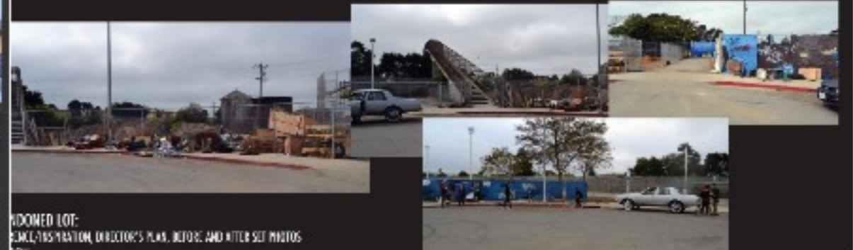
DOOMED LOT: SAMPLES/INSPIRATION, DIRECTOR'S PLAN, BEFORE AND AFTER SET PHOTOS