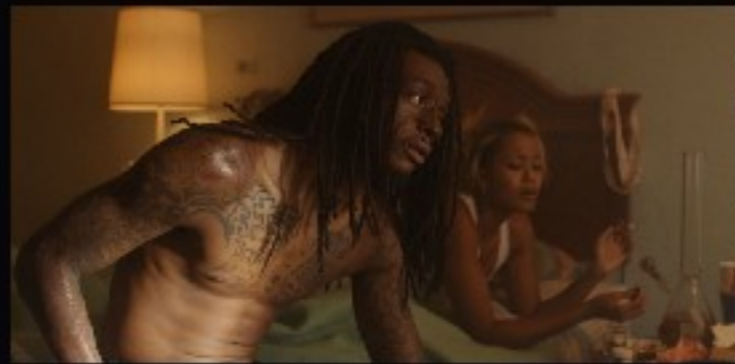
REFERENCE BOARD FOR NICKS: Color/Lighting, texture/Composition, Magical Realism/Graphic Elements